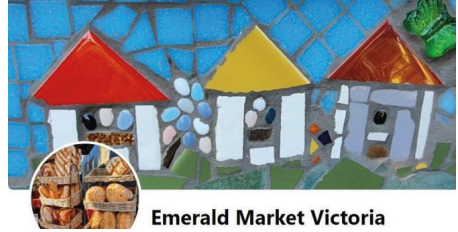
Emerald Market Victoria